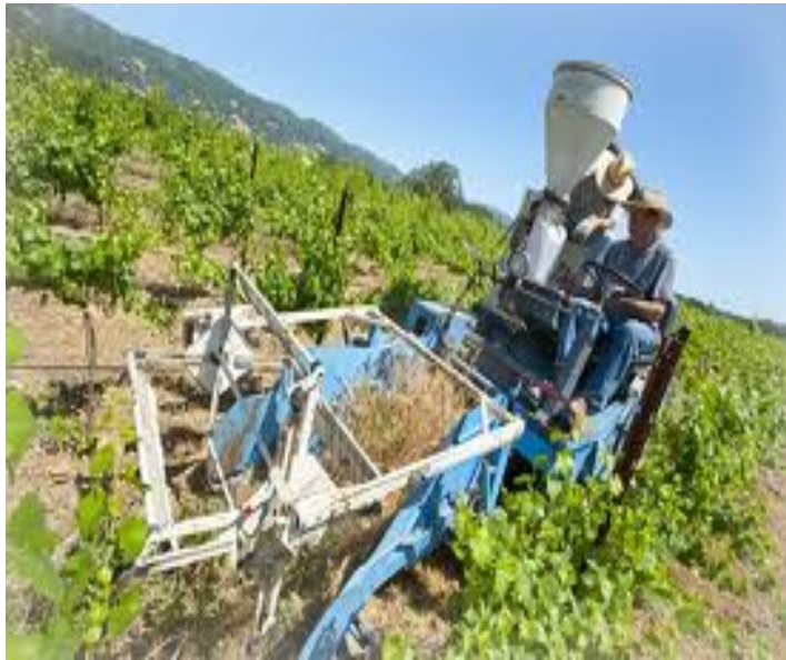
Doug Mosel with mini combine harvesting grain in Mendocino County between rows of wine grapes